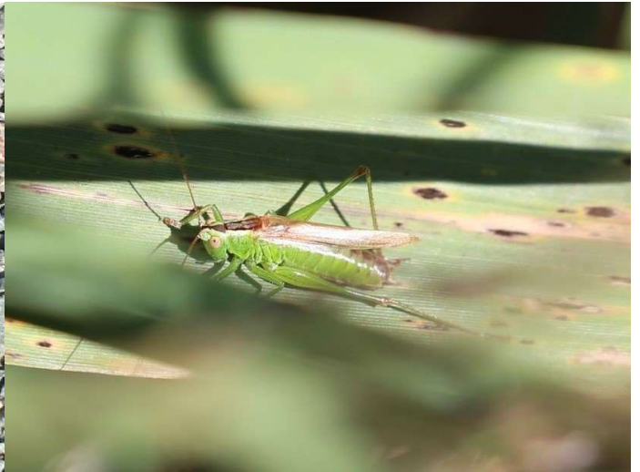
Long-Winged Conehead bush-cricket