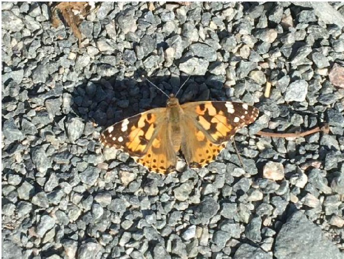
Painted Lady butterfly

On the same day we also recorded a Common Lizard and a Slow Worm. The most impressive sighting though was the Grass Snake skin that Simon and Carla found. Snakes cast their skins as they grow - the fact that the skin measured a metre long means that there is now a very large snake on the reserve! (Note, of course, that Grass Snakes are completely harmless to people - and dogs). We await further sightings!