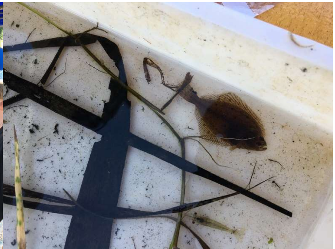
Young Flounder (and Ditch Shrimp)

Throughout the day, Simon Wood manned the identification desk, explaining what all the finds were and, more importantly, providing lots of information about the background and lifestyle of the creatures involved.