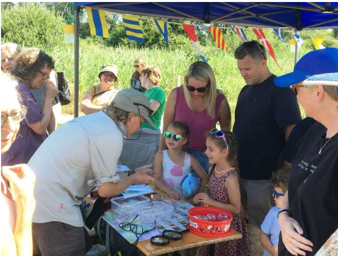
Family Nature Day

As last year, we were lucky with the weather and were pleased to welcome a wide range of people to our family & community nature day on the reserve. Popular activities included a wildflower search (with a check-sheet of species to look for), bug hunting and dipping for creatures in the Kingsmere. The last produced some surprises in the form of a couple of fish - a Three-spined Stickleback and a young Flounder. There were also some moths on view that had been caught at the reserve the previous night, including Oak Eggar, Ruby Tiger and Drinker.