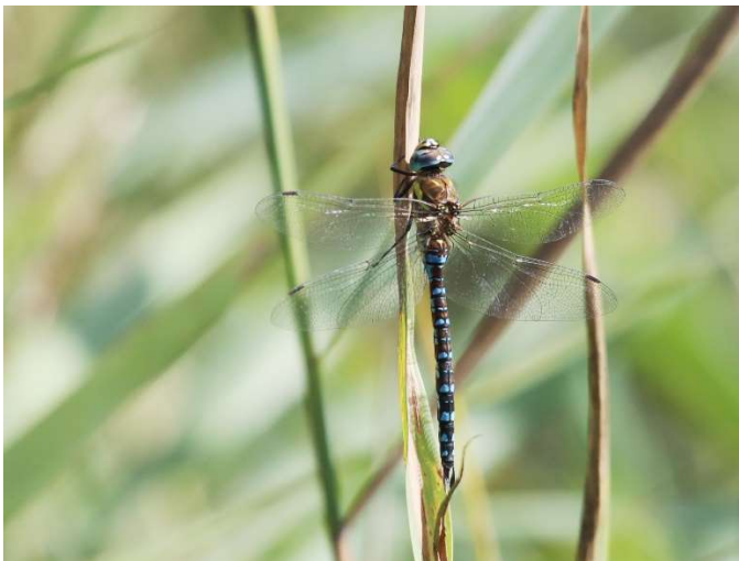
Migrant Hawker dragonfly