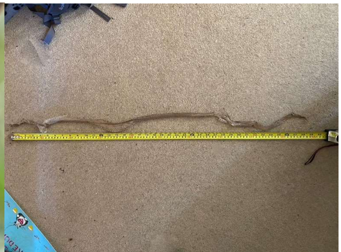
Grass Snake skin found on the reserve