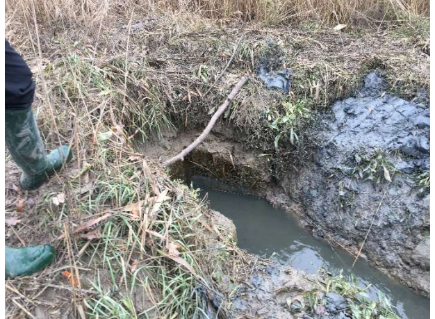
The culvert running through the sea wall, draining into the tidal river.